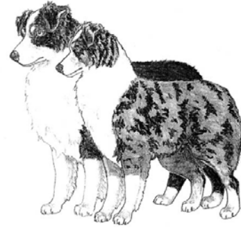
Merle bitch with Tri dog in background Trim color is optional and not to be preferred

GENERAL APPEARANCE: The Miniature Australian Shepherd is a well-balanced herding dog of small to medium size. Bone is also moderate and in proportion to body size. He is attentive and animated, showing strength and stamina with coloring that offers variety and individuality in each specimen. Slightly longer than tall, he has a coat of moderate length and coarseness with coloring that offers variety and individuality in each specimen. An identifying characteristic is his natural or docked bobtail. In each sex, masculinity or femininity is well defined.